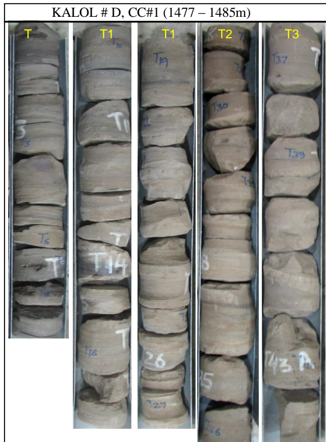
Core photograph showing fine grained well sorted sandstone developed in sand flat complex