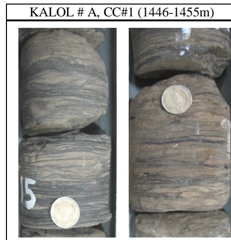
Close up of selected core segments showing laminated siltstone-shale developed in mixed flat complex.